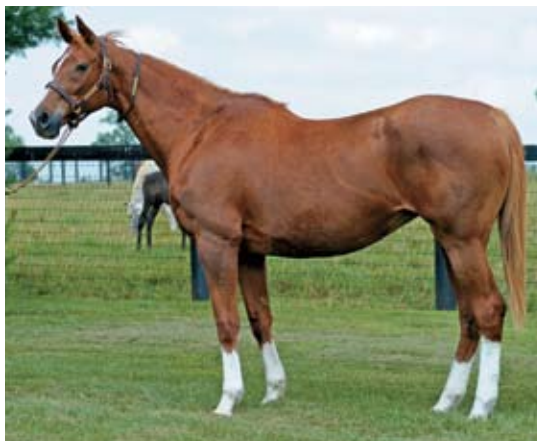
Champagne Glow has been bred back to Roman Ruler

The Robinsons and Liberation Farm are the breeders of additional 2011 stakes winners Street Storm and Vision in Gold, the