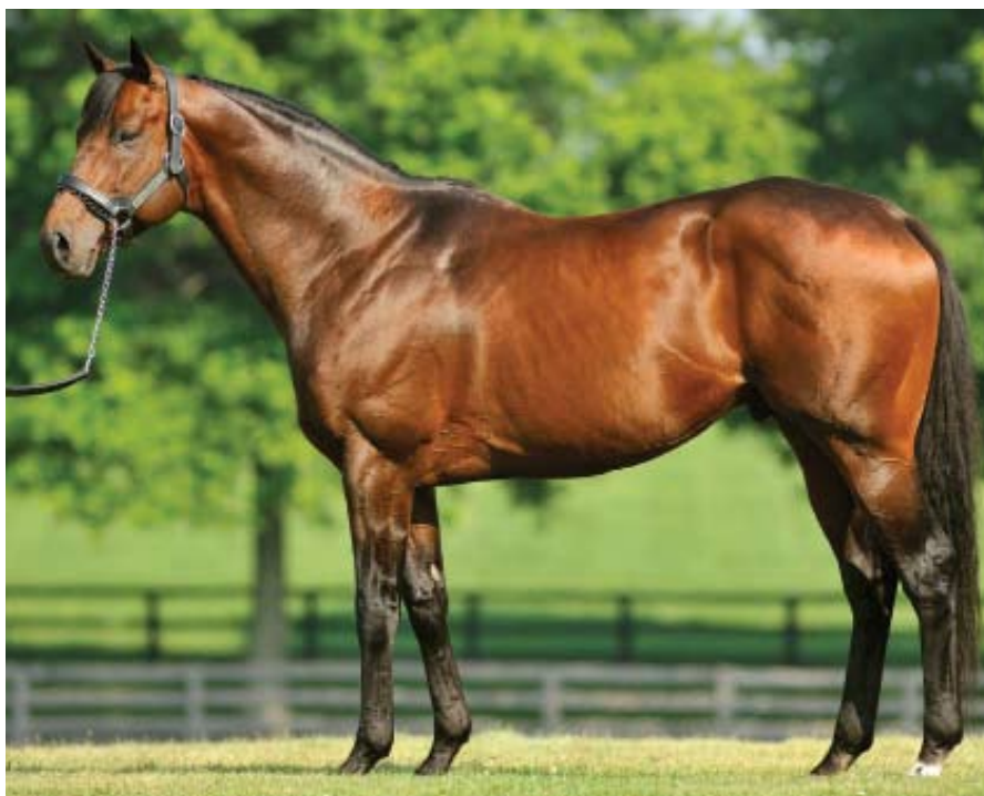
In siring a Belmont Stakes winner, Roman Ruler adds versatility to his résumé