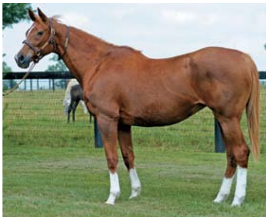
Champagne Glow has been bred back to Roman Ruler